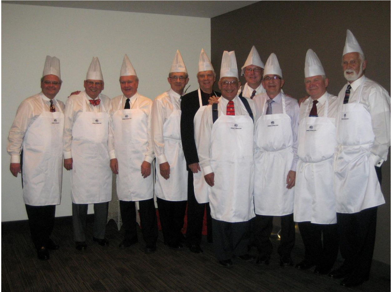
The Turkey Carvers