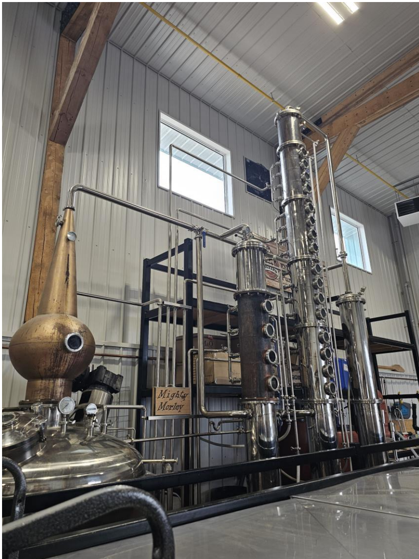
Mighty Morley Distiller

The distillery makes vodka, gin, whiskey, rum, honey mead and liqueurs using locally sourced Alberta ingredients. It also just recently started making craft beers. The Mighty Morley distiller processes various grains to produce vodka which is also the source of all gin products. The Schatzi distiller produces the darker colour alcohols such as rum and rye whiskey.