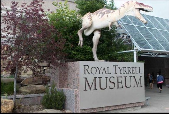
A World-Class Exposition!