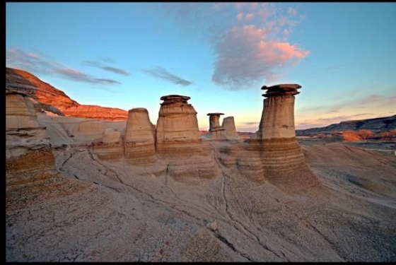
Hoo Doos and Badlands!