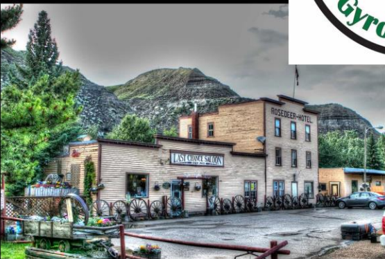
Last Chance Saloon - Yahoo!