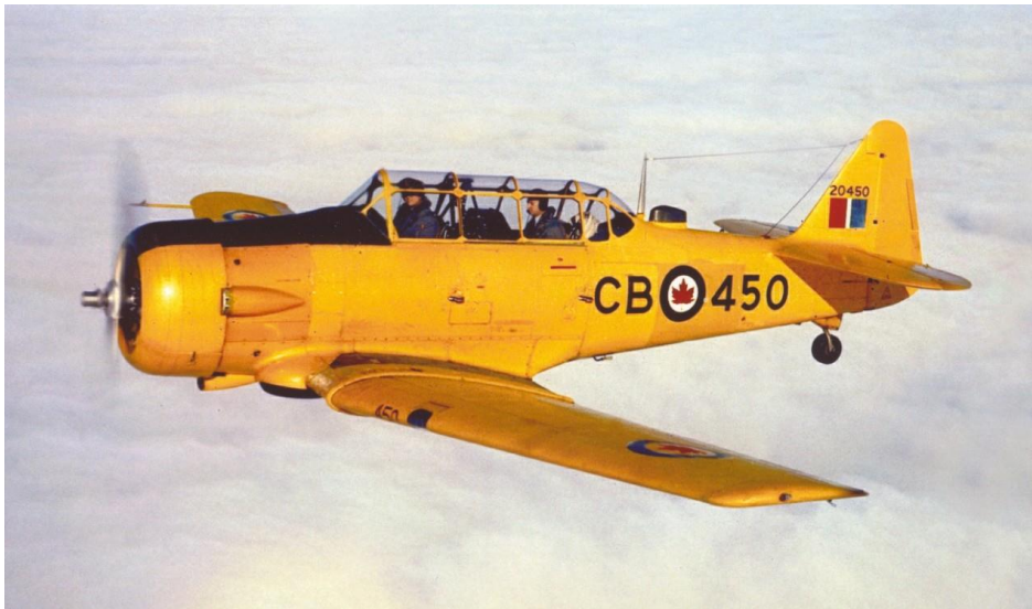
North American Harvard